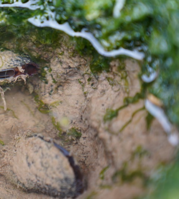
Above: Mussels have appeared in an artificial rockpool at Hamble Harbour, UK.